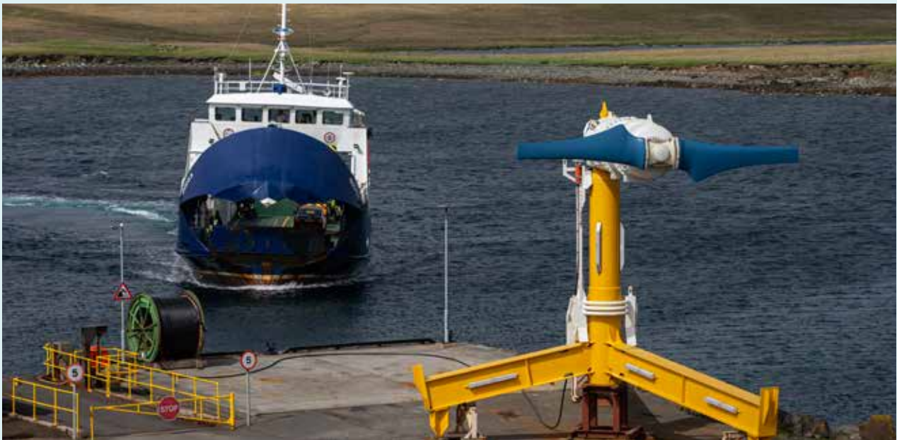
Enunice tidal turbine before deployment