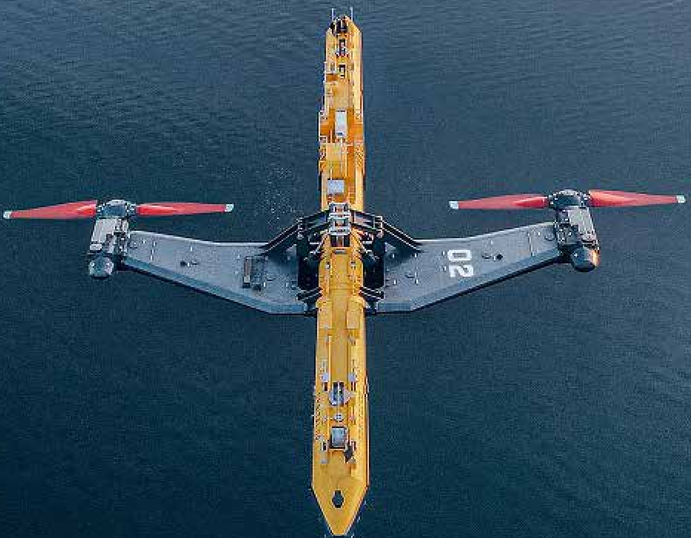
Orbital Marine Power's O2 turbine