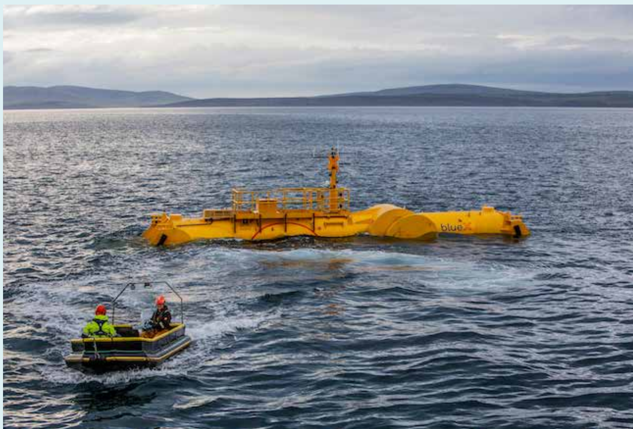
Mocean Energy Blue X prototype testing