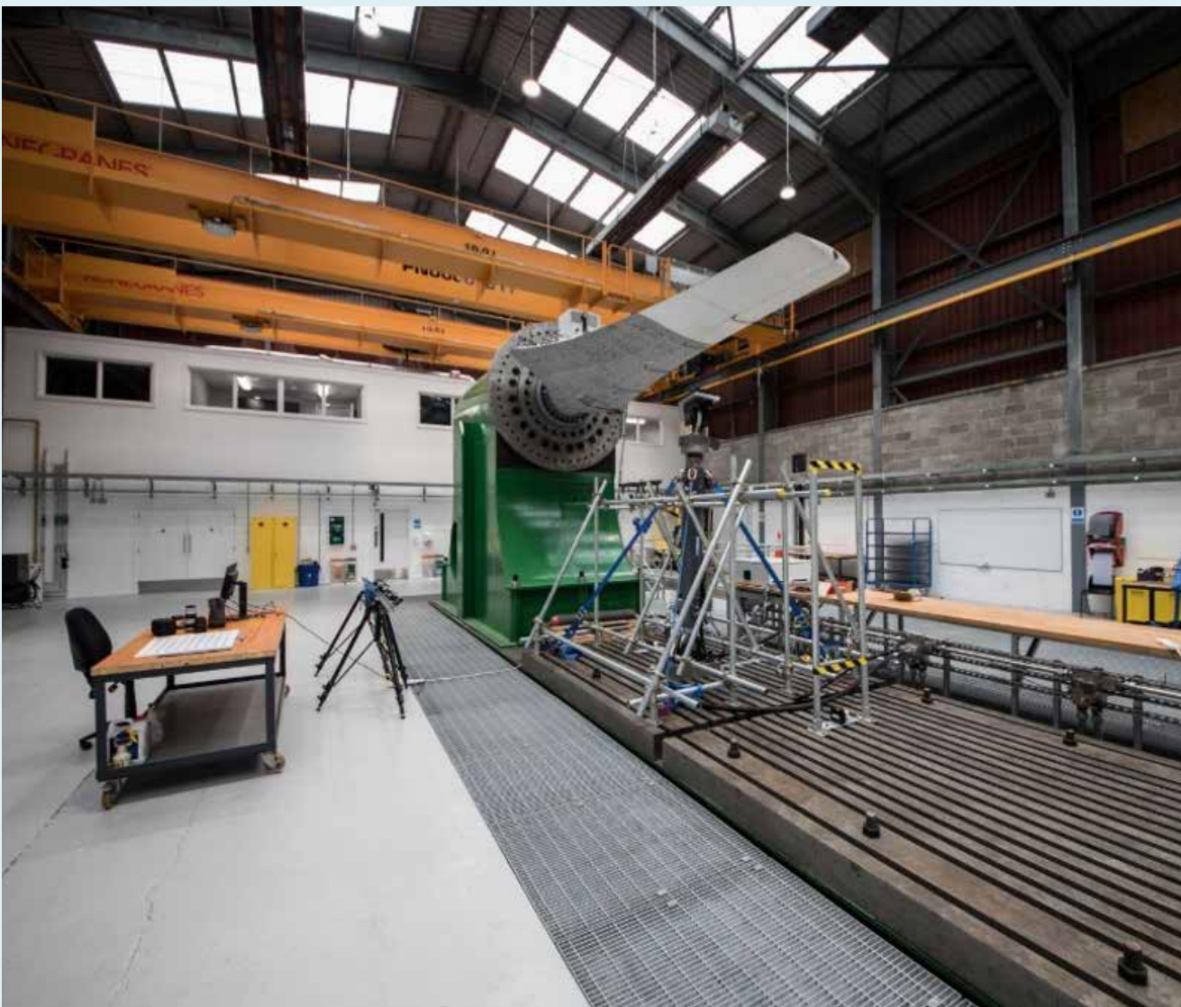
FastBlade Test Site