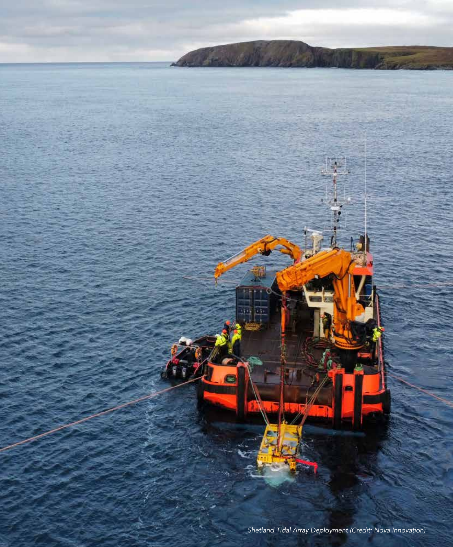
Shetland Tidal Array Deployment