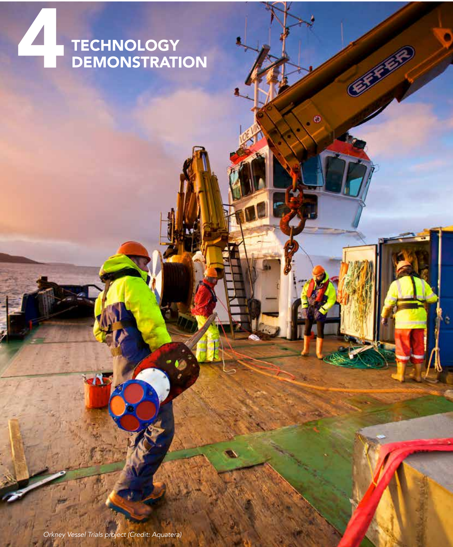
Orkney Vessel Trials project