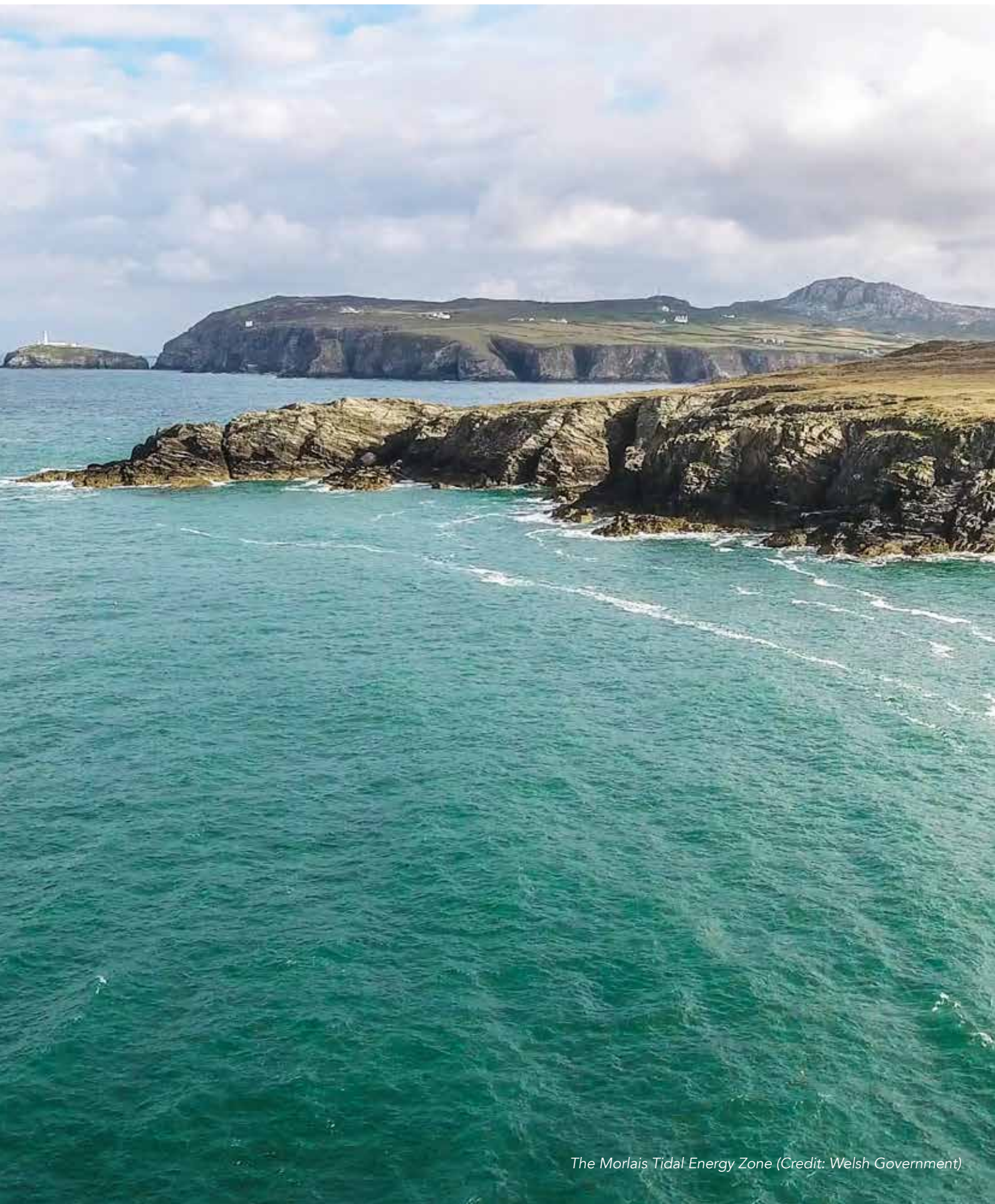
The Morlais Tidal Energy Zone