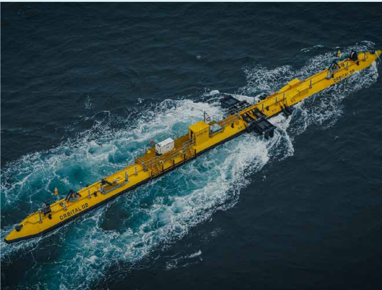
Orbital O2 operating at EMEC test site