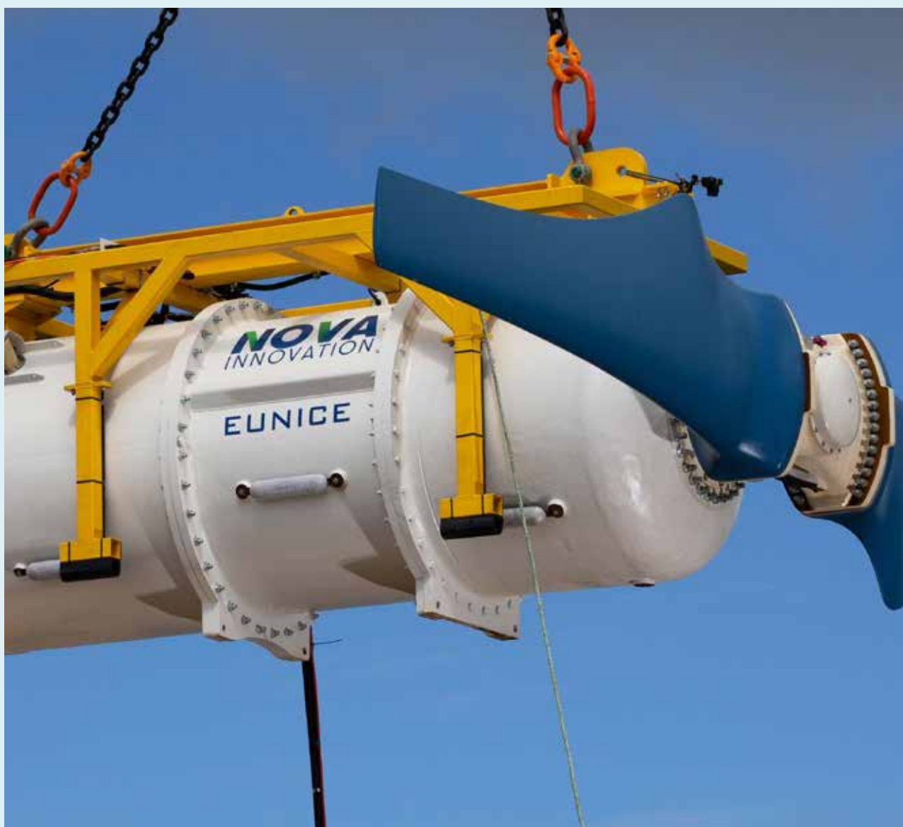
Nova Innovation Eunice turbine