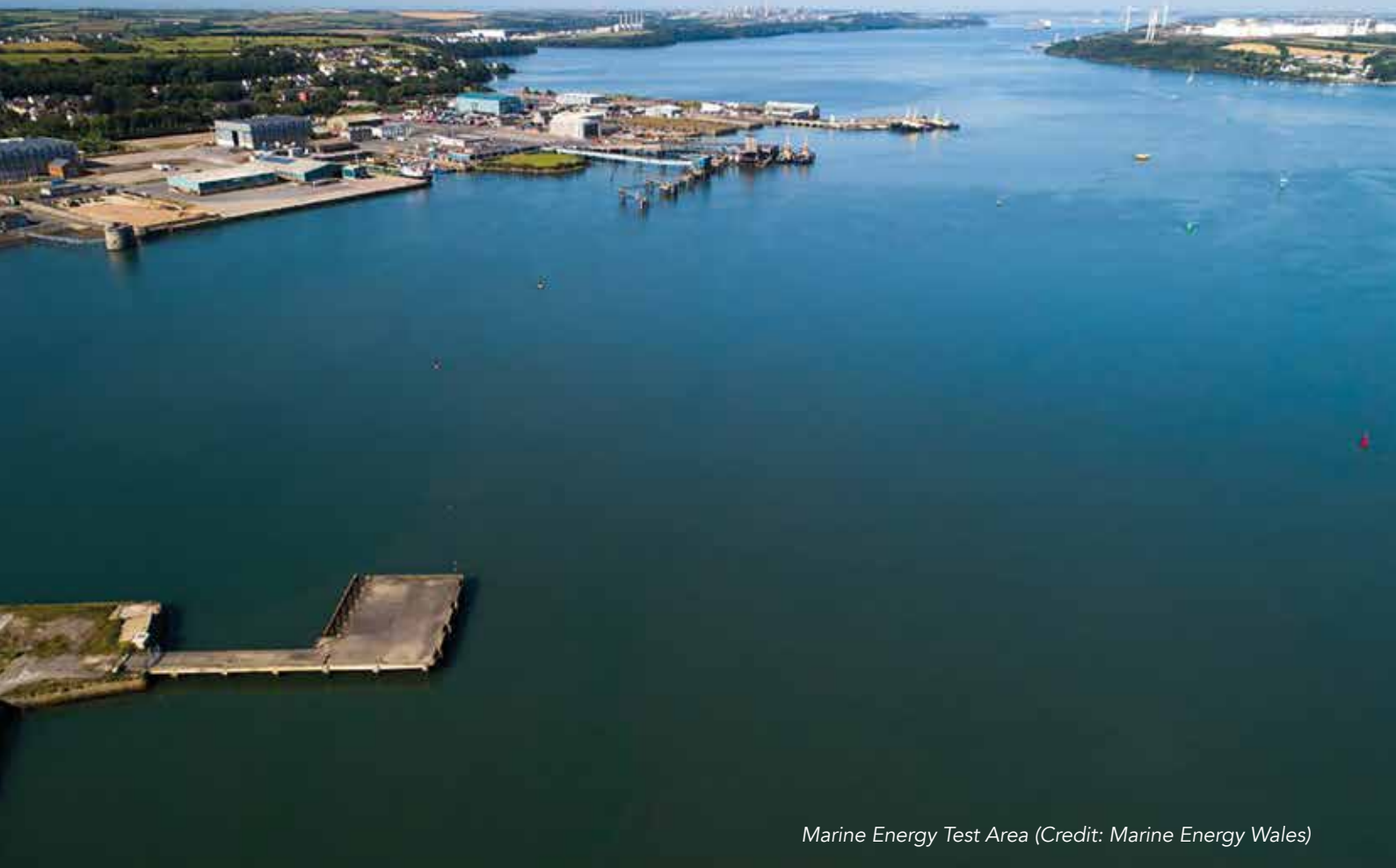
Marine Energy Test Area

https://www.marineenergywales.co.uk/meta/