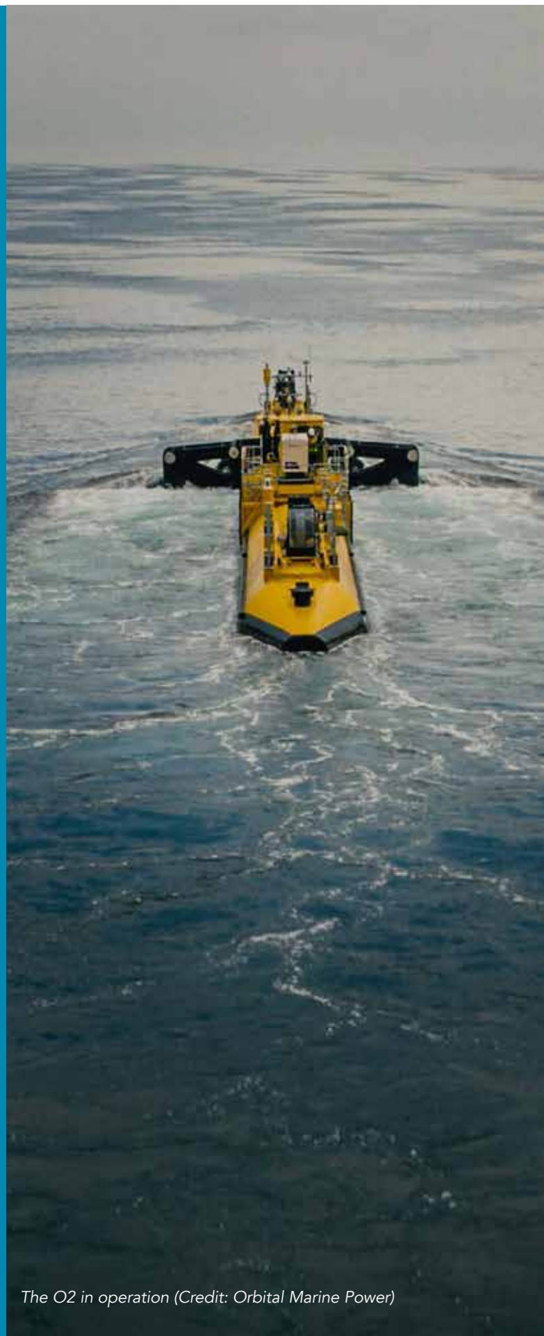
The O2 in operation