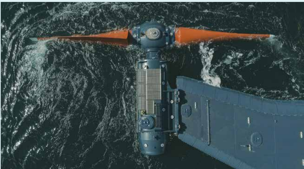
Orbital O2 turbine blade at EMEC