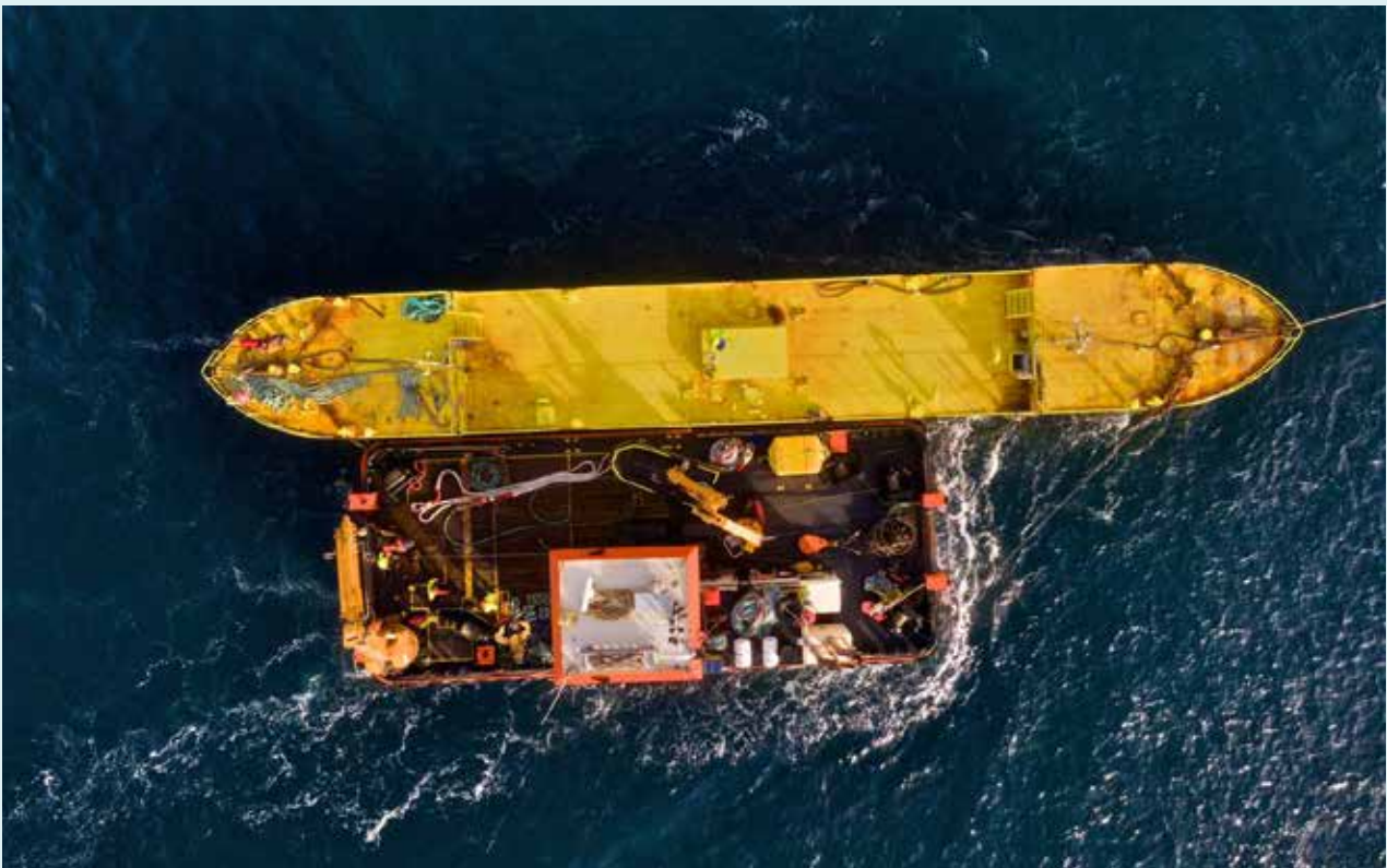
Magallanes Renovables ATIR turbine