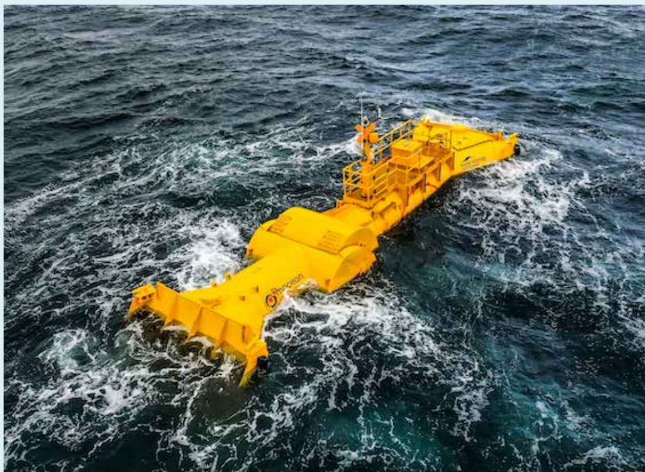
Mocean Energy Blue X device at EMEC