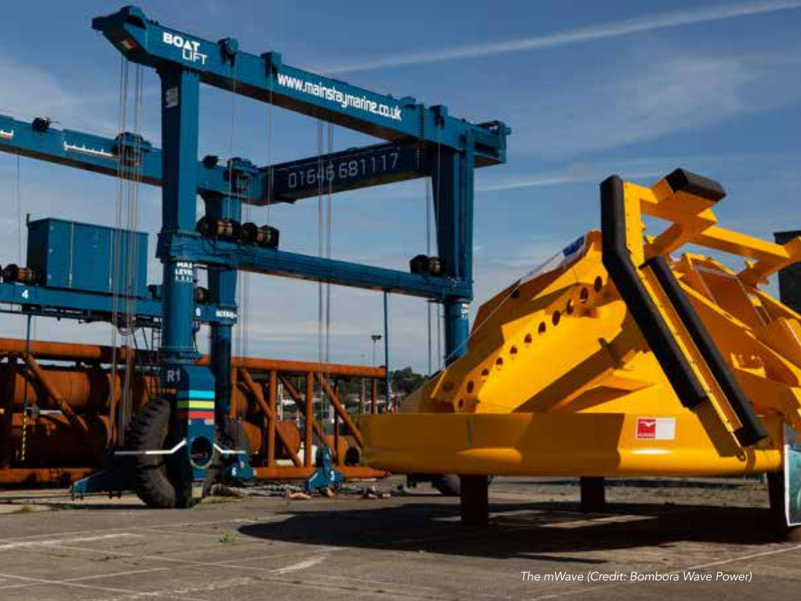
The mWave