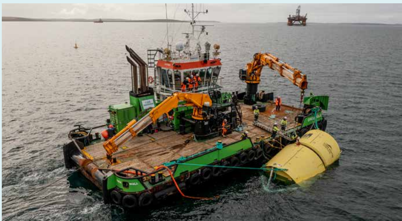
AWS device testing at EMEC Scapa Flow test site