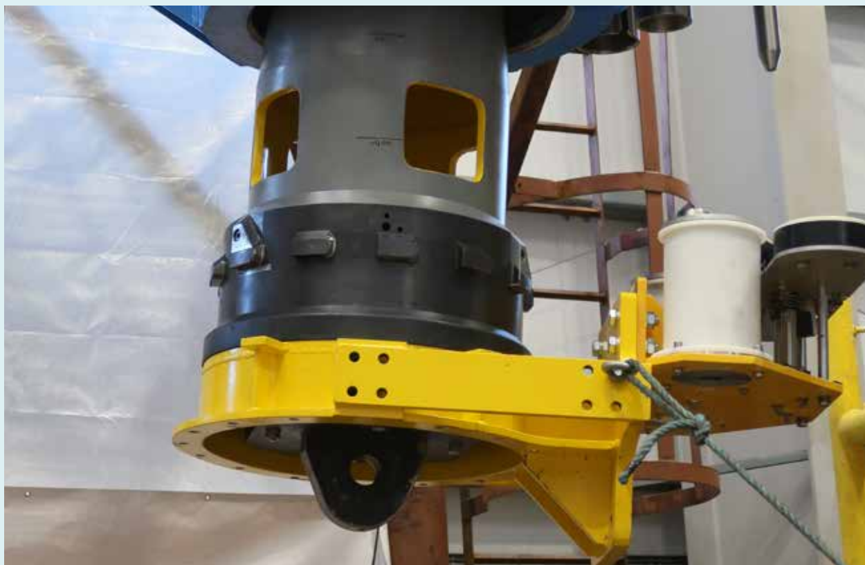
Quocean's Q-Connect quick connection system