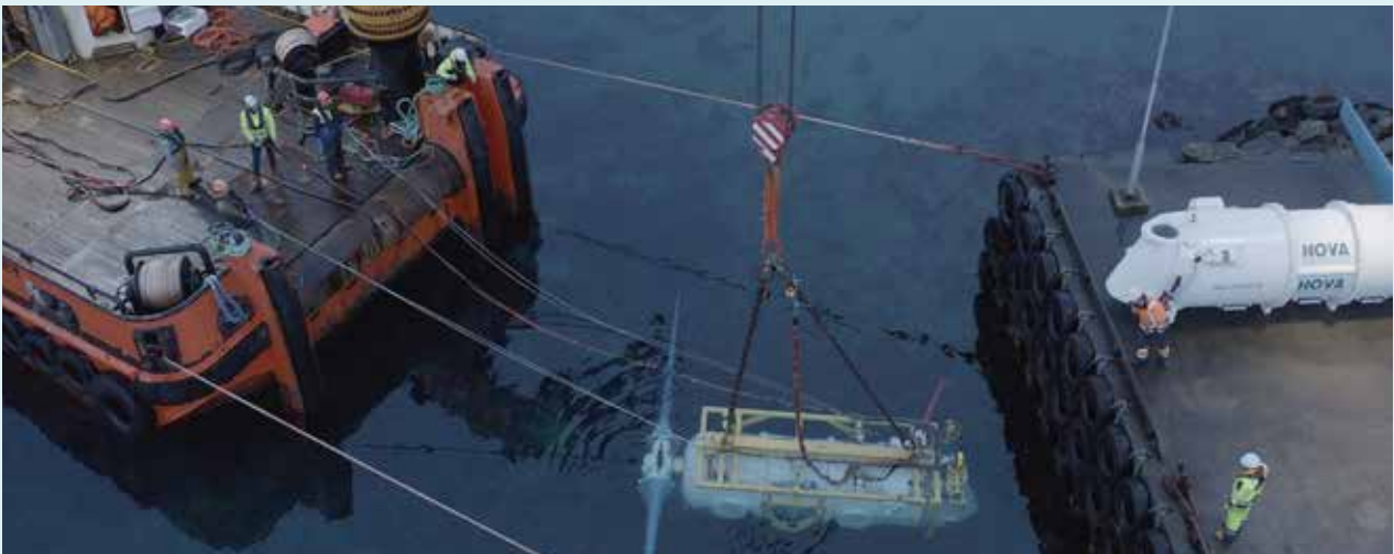
Deployment of turbine 5, Grace, for Nova Innovation