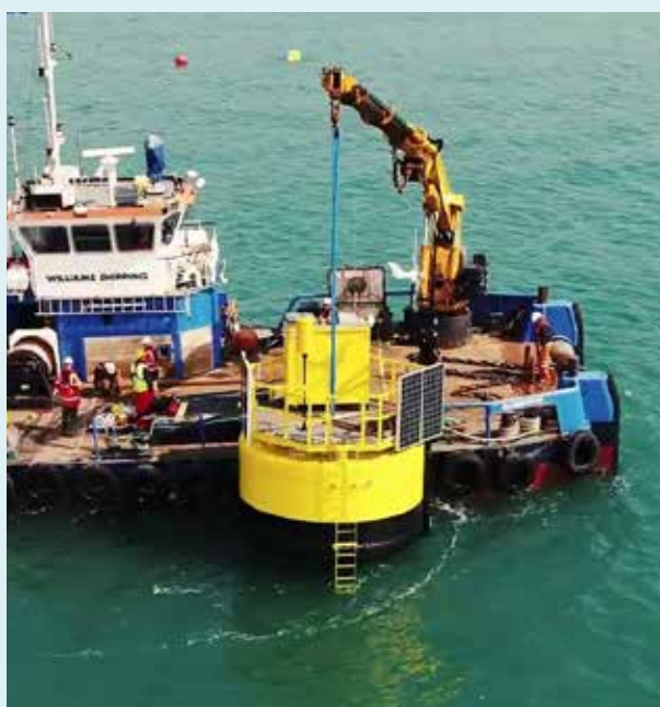
MEECE Research Buoy