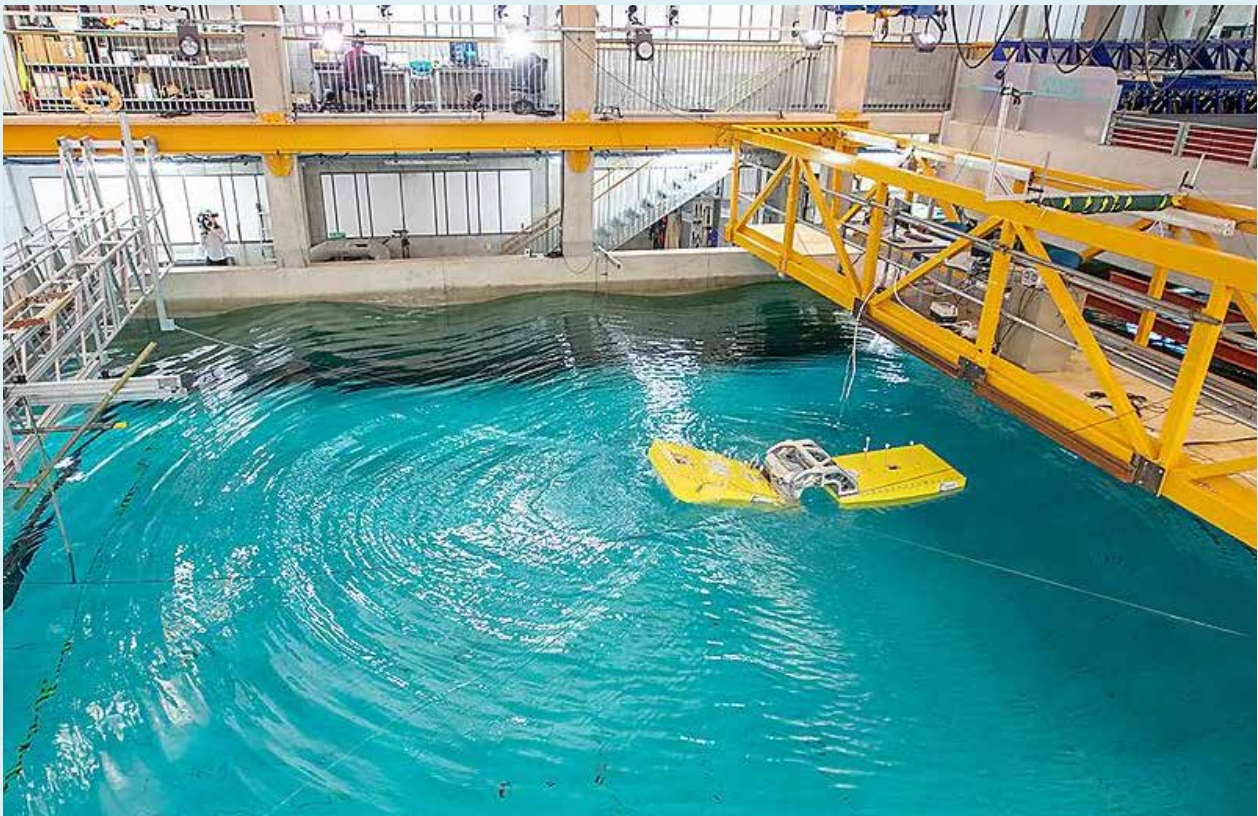
Tank testing at University of Plymouth's COAST Lab